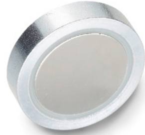
View of magnetic surface